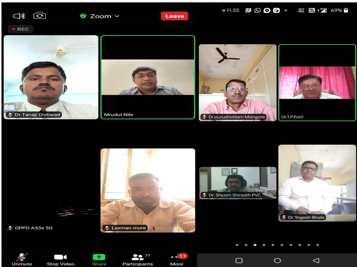
Online National Seminar Live Program Screen Shots Images.