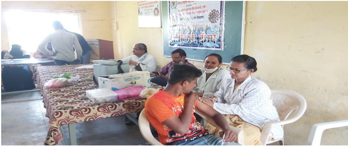
मिशन कवच कुंडल मोहिमे अंतर्गत महाविद्यालयात लसीकरण कॉम्प-२ उपस्थित स्वयंसेवक आणि कोरोना योधेव स्टाफ