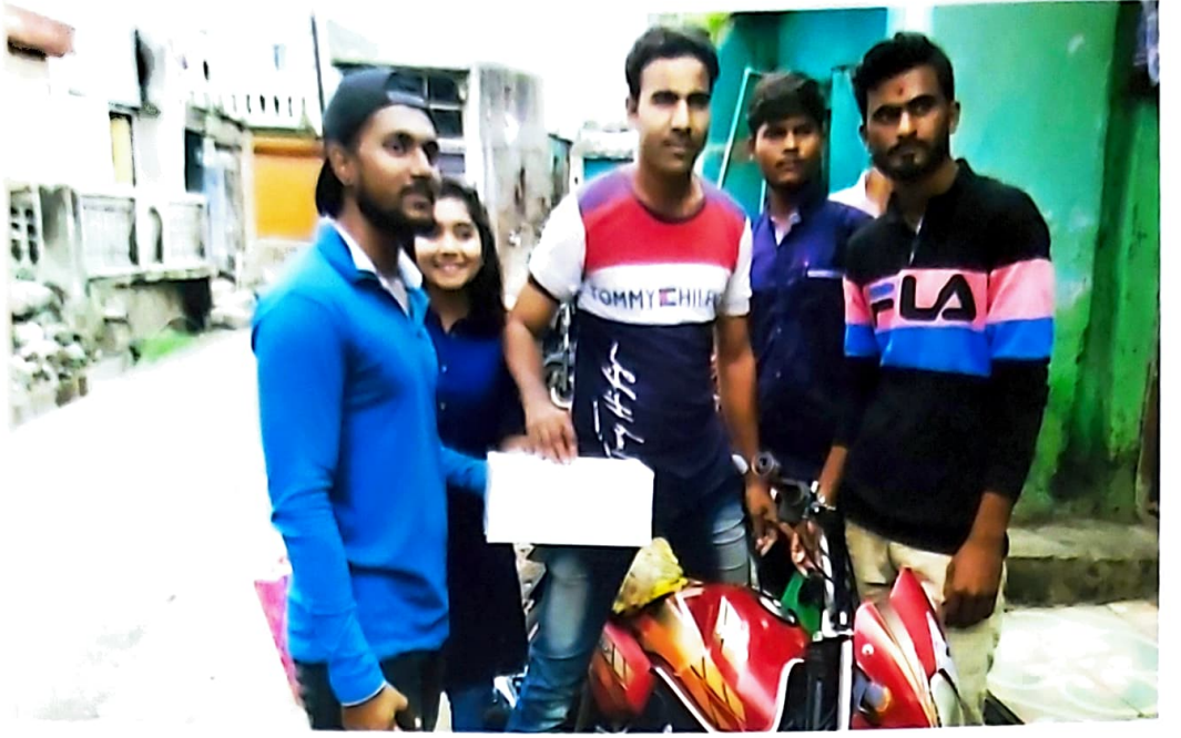
मदतनिधी जमा करताना स्वयंसेवक