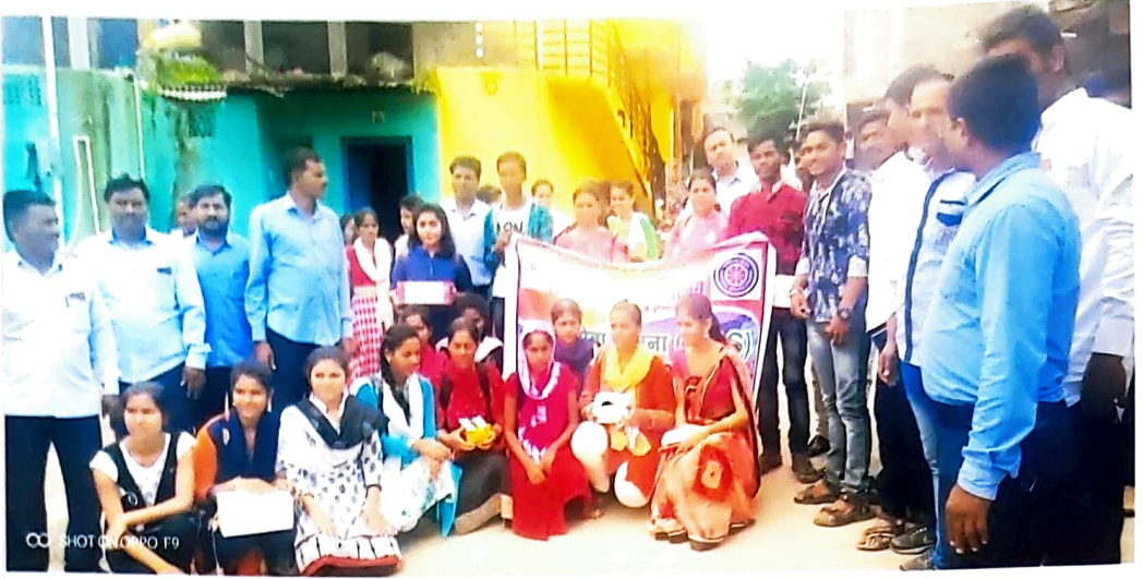
सातारा, सांगली कोल्हापुर पुरश्चस्तासाठी मदत निधी रॅलीमध्ये सहभागी स्वयंसेवक व प्राध्यापक