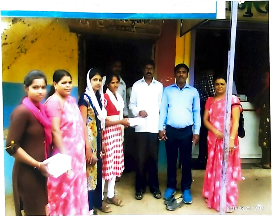
नागापुर येथे पुरवृत्तासाठी मदत निधी जमा करताना